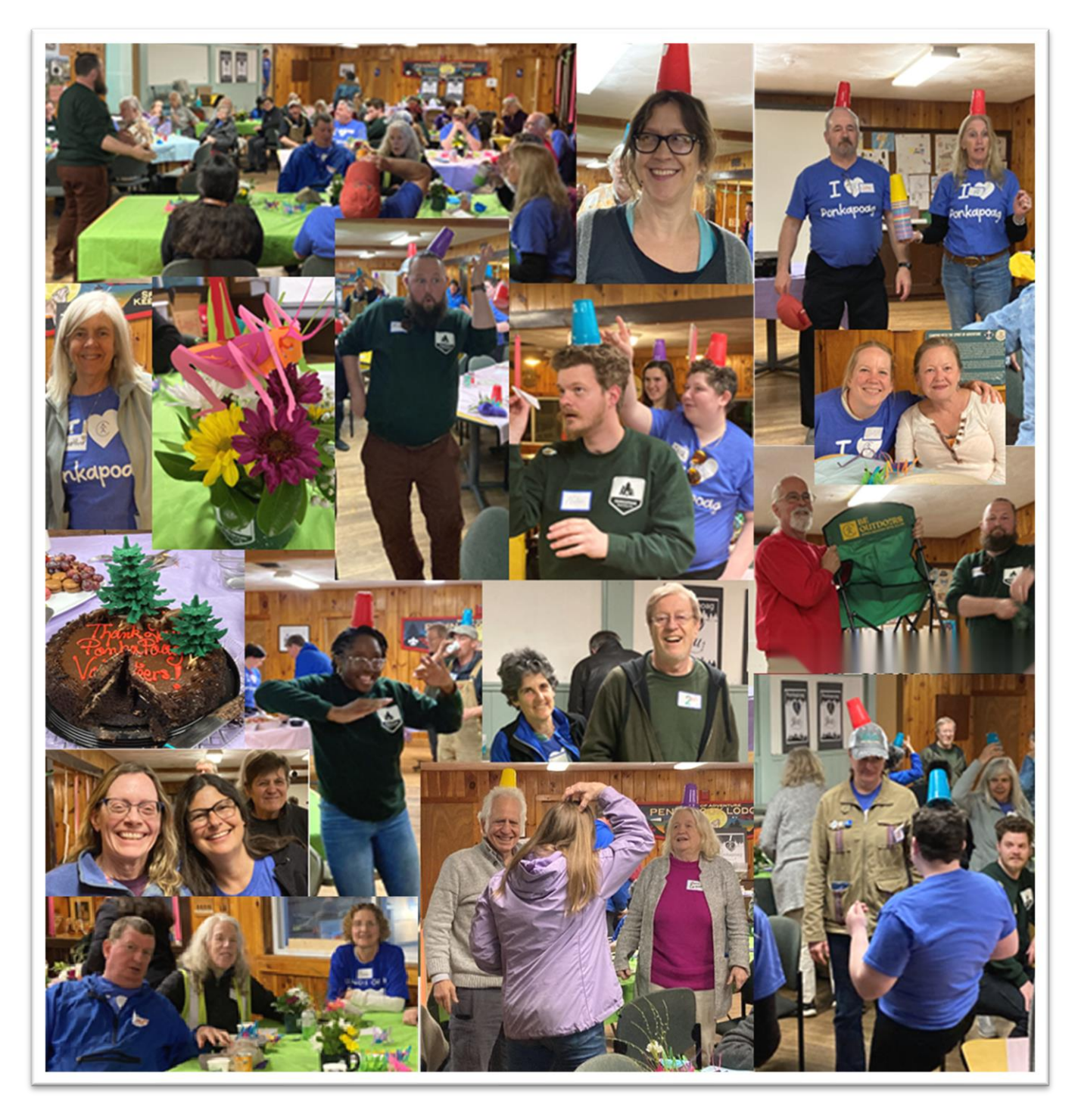
Ponkapoag Volunteer Appreciation Event 2024!

Let's just say, Ponk volunteers had a blast!