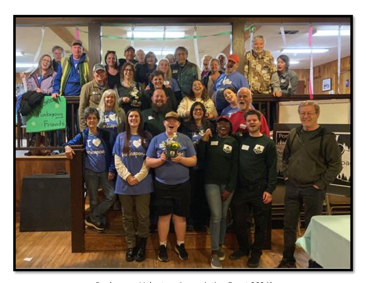
Ponkapoag Volunteer Appreciation Event 2024!